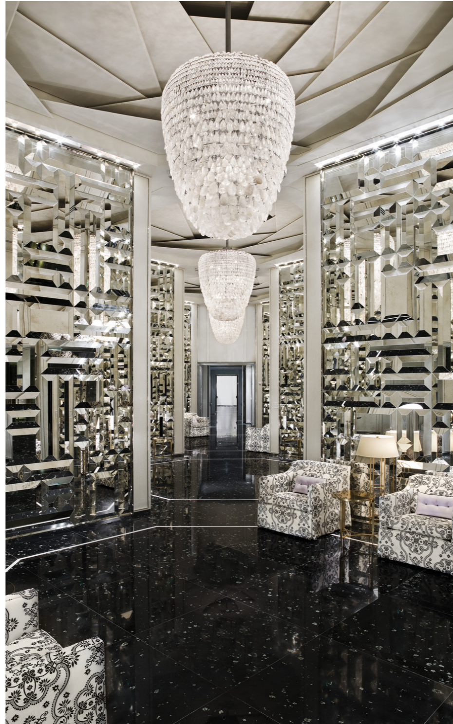
The St. Regis Bal Harbour Resort