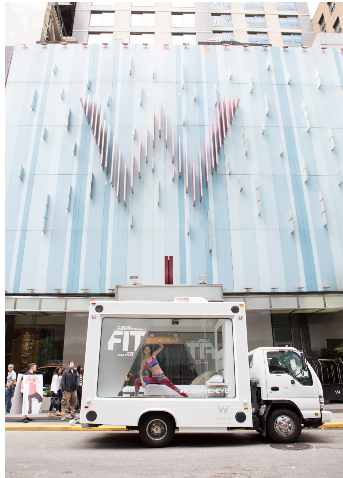
Launch of W Hotels partnership with Tara Stiles

: Wellness tourism, set to grow at 9% annually (twice the general rate of global tourism), evolving it into a $678.5 billion market by 2017.