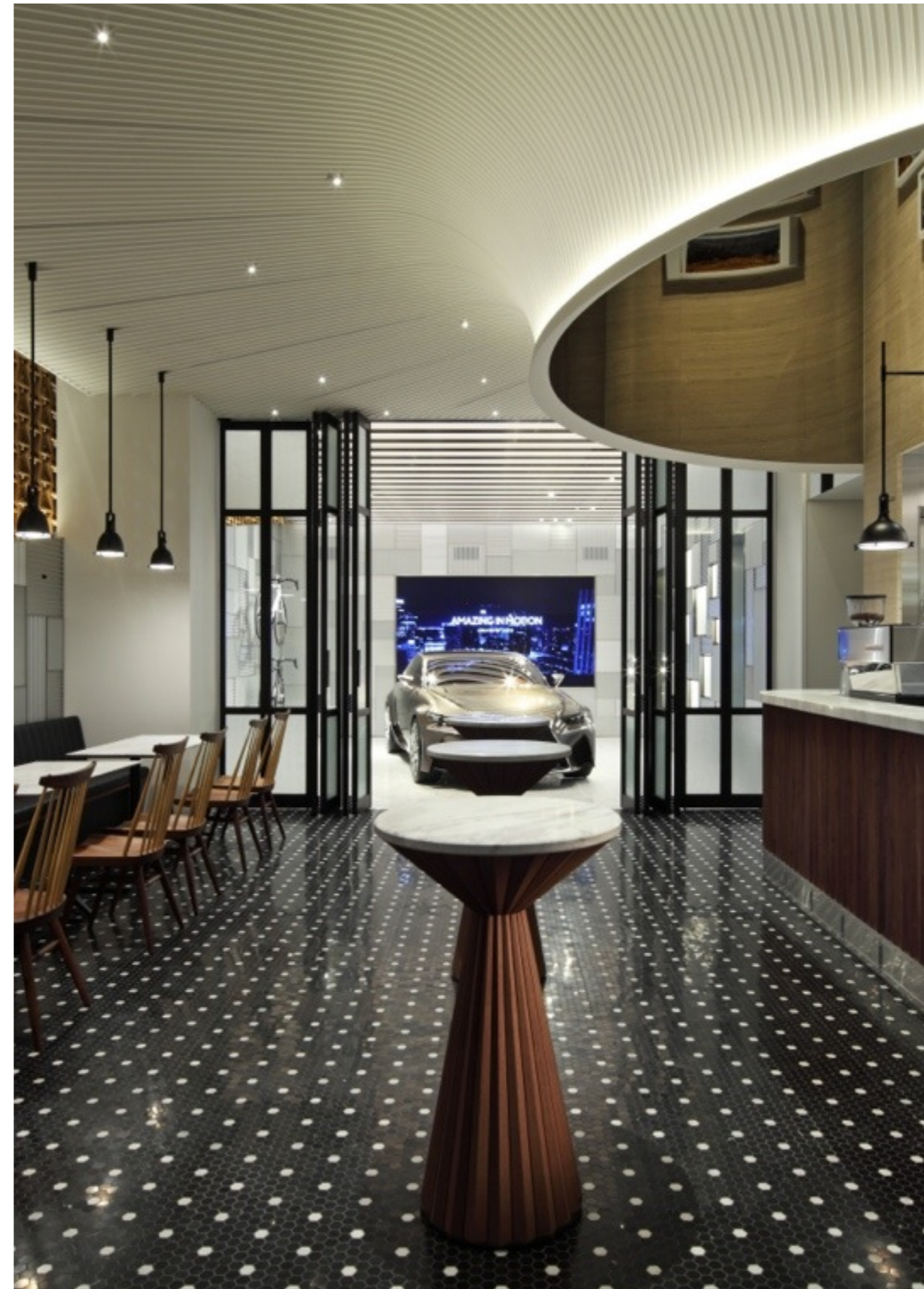
Intersect by Lexus, Tokyo