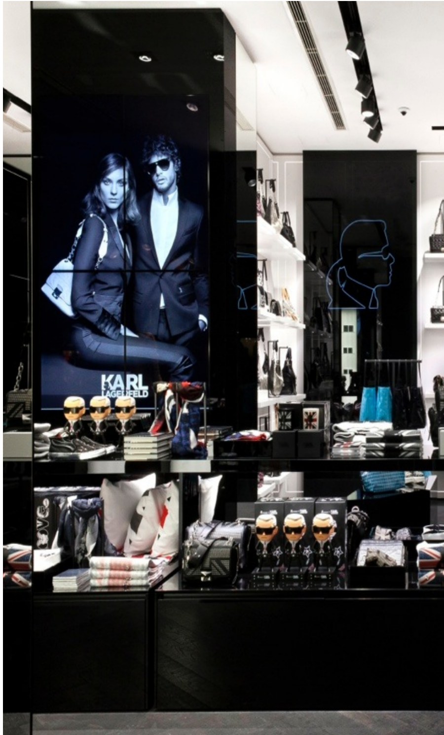
Karl Lagerfeld Boutique, Regent Street, London