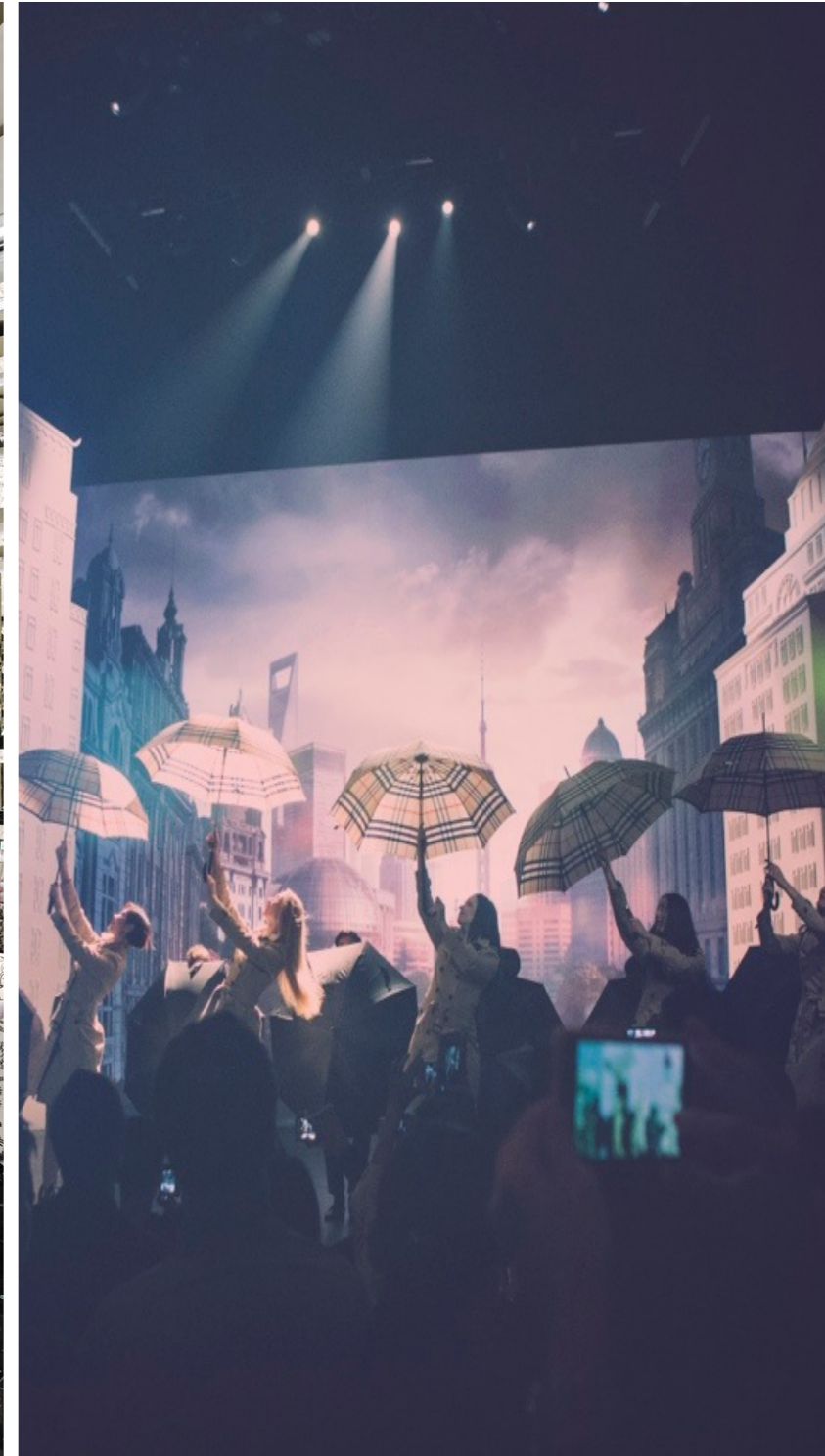
Burberry AW14 Show, Shanghai