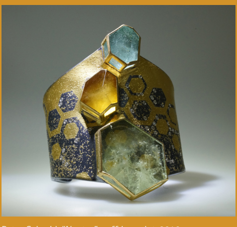
Peter Schmid "Nectar" cuff bracelet, 2016, 24 kt. gold on oxidized sterling, set with three large hexagonal green beryl, yellow beryl and blue beryl (aquamarine) gems, accented with diamonds; 2½" x 3¼" x ½".