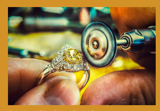
Polishing a Ring.