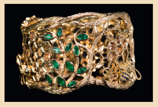
Temple St. Clair, The Bee Bracelet , 2016, from The Big Game , 18 kt. gold with Imperial topaz, Ceylon sapphire and diamond.