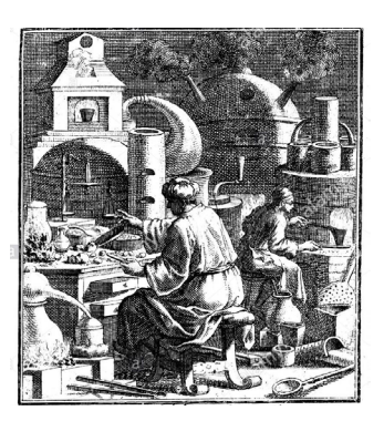
Christoph Weigel, Alchemist Producing Gold, 1698, copper engraving from Classes Book of Christoph Weigel.

8:45 – 9:15 a.m. Registration and continental breakfast