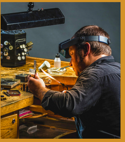
Jeweler at the Bench.