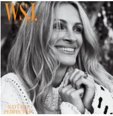
WSJ. magazine's May cover

Mine the wisdom of the publisher of The Wall Street Journal's WSJ. magazine, editor of ForbesLife and founder of blogging network Style Coalition and see how they view the holiday mindset of the luxury consumer during this shopping season. In this session, these executives will discuss: