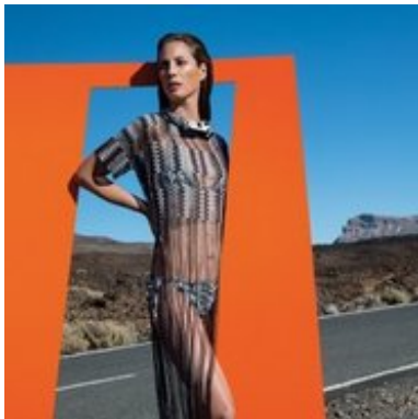
Missoni on home stretch