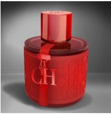
Capping it for Carolina Herrera's CH

It is easy to start and end marketing with social media. But tweets, pins, posts and videos are mere tactics that are often confused for strategy. Conveying the brand's values through a diffusing media business is getting more challenging. Old stays such as print advertising in luxury media support brand objectives, buttressed by in-store and consumer events, sponsorships of causes, social media and online and mobile marketing. But is that enough? Also: