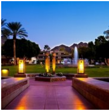
Lighting the senses at Arizona's Waldorf Astoria Biltmore

Attendees to the Luxury Retail Summit will hear how Hilton Hotels' Waldorf Astoria, MissoniHome and Christie's Watch Shop approach luxury hospitality and retailing, especially as the holidays near.