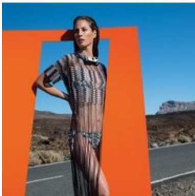
Missoni on home stretch