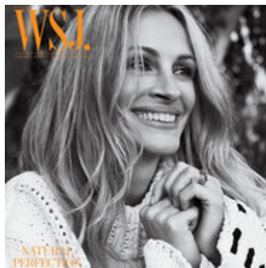
WSJ. magazine's May cover