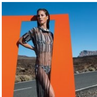
Missoni on home stretch