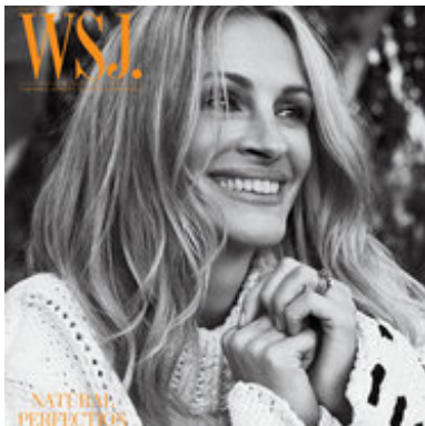
WSJ. magazine's May cover