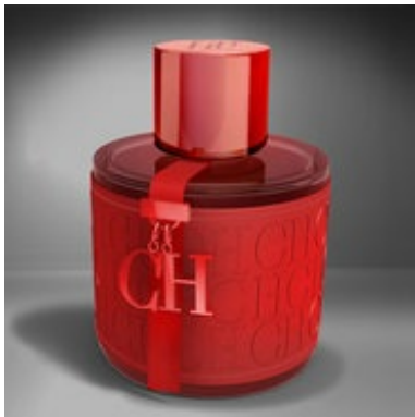
Capping it for Carolina Herrera's CH

Is the Marketing Evolving with Luxury Consumers?