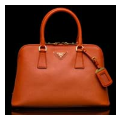
Prada to te