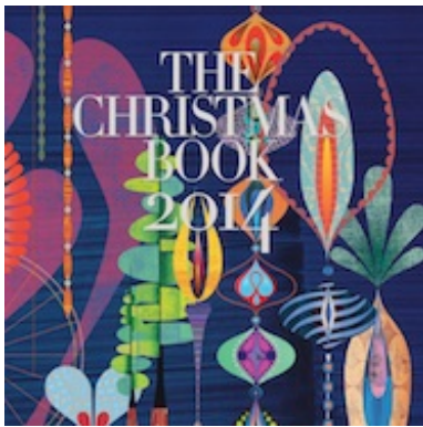
Cover of Neiman Marcus 2014 Christmas Book