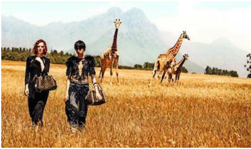
Louis Vuitton Spirit of Travel campaign image

Louis Vuitton reinterpreted the house's codes and visual imagery under the direction of Nicolas Ghesquière for his first advertisement campaign as creative director, titled "Series 1."