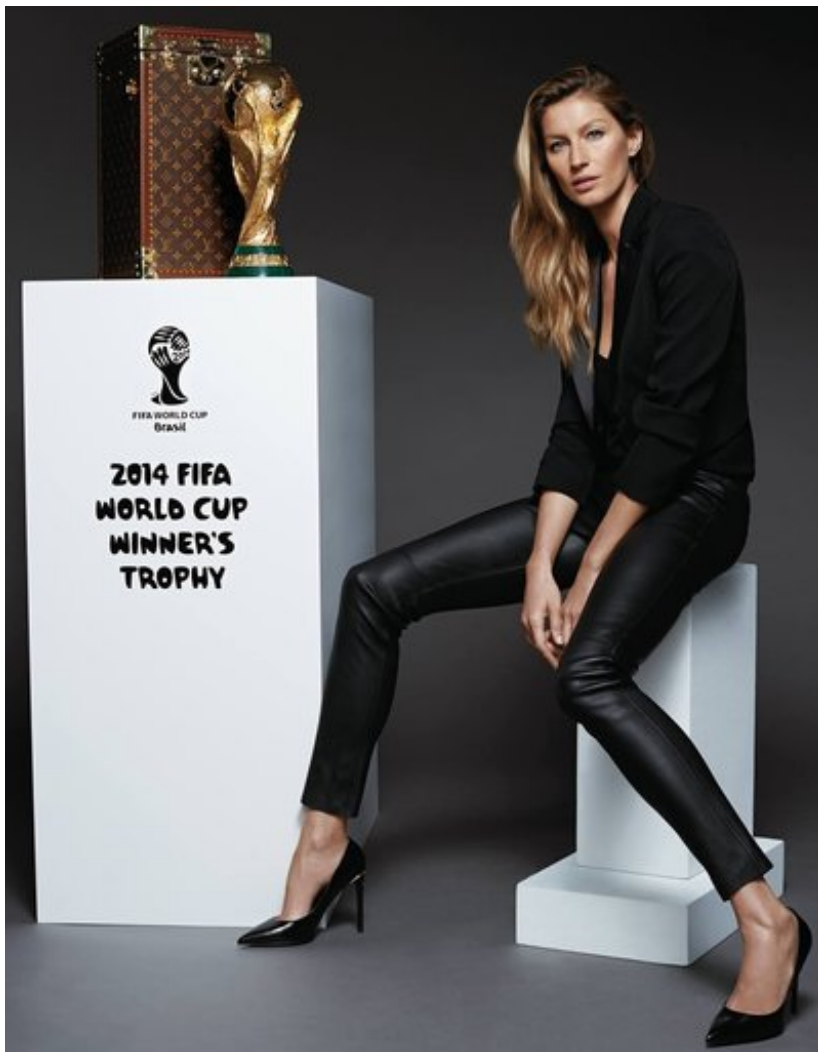
Louis Vuitton trunk for FIFA

This year, Louis Vuitton also lent support to LVMH's newly opened Fondation Louis Vuitton, holding its spring/summer 2015 runway show in the space.