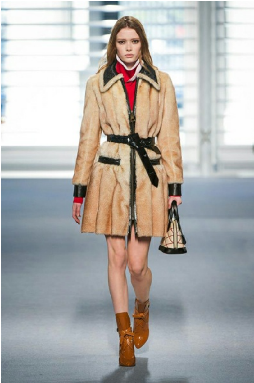
Louis Vuitton fall/winter 2014 runway show

Compared to the spectacle Louis Vuitton runway shows became known for under the creative direction of Marc Jacobs, the label's fall/winter 2014 fashion show, the first by Mr. Ghesquière, showed a focus on simplicity.