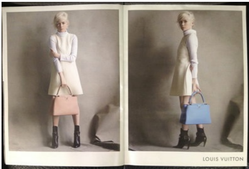
Louis Vuitton ad in W magazine October

Louis Vuitton has also entered the publishing game itself. Starting in October Louis Vuitton began publishing “The Book,” a biannual, in-house glossy magazine. The branded print publication will be translated into 11 languages and mailed only to select Louis Vuitton clients ( see story ).