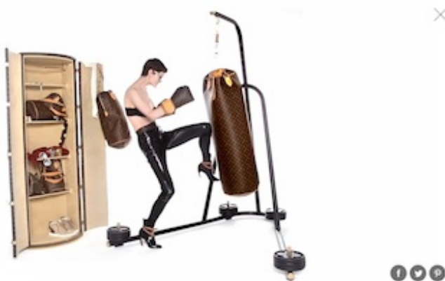
Campaign image for Iconoclasts collection

For this project, Louis Vuitton chose shoe designer Christian Louboutin, photographer Cindy Sherman, architect Frank Gehry, fashion designer Karl Lagerfeld, industrial designer Marc Newson and fashion designer of Comme des Garçons, Rei Kawakubo ( see story ).