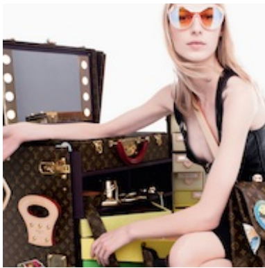
Promotional image for Louis Vuitton Iconoclasts line