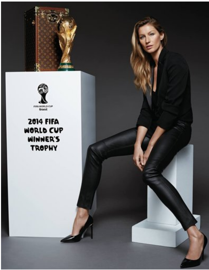
Louis Vuitton trunk for FIFA

This year, Louis Vuitton also lent support to LVMH's newly opened Fondation Louis Vuitton, holding its spring/summer 2015 runway show in the space.