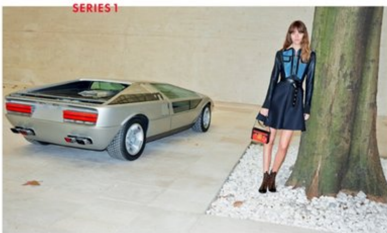
Louis Vuitton Series 1 campaign image

Mr. Ghesquière recruited three iconic photographers to interpret his designs from the fall/winter 2014 collection. The campaign features the work of Annie Leibovitz, Juergen Teller and Bruce Weber, all of whom chose their own model and scenario ( see story ).