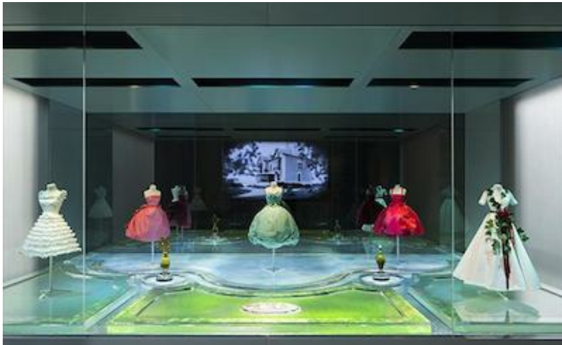
Le Petit Théâtre Dior exhibit

"Le Petit Théâtre Dior," a traveling exhibit which recreates couture garments in miniature form, opened at its first stop, the label's Chengdu, China flagship store ( see story ). Dior also delved into its photogenic history with an exhibit and tome focused on the iconic images that shaped the label ( see story ).