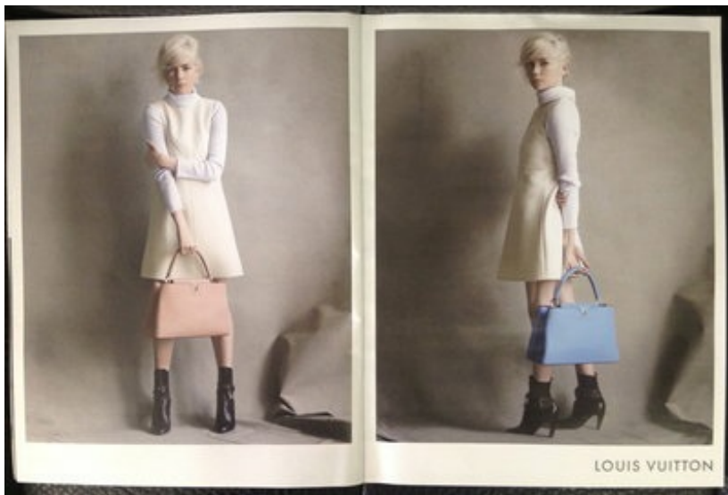
Louis Vuitton ad in W magazine October

Louis Vuitton has also entered the publishing game itself. Starting in October Louis Vuitton began publishing “The Book,” a biannual, in-house glossy magazine. The branded print publication will be translated into 11 languages and mailed only to select Louis Vuitton clients ( see story ).