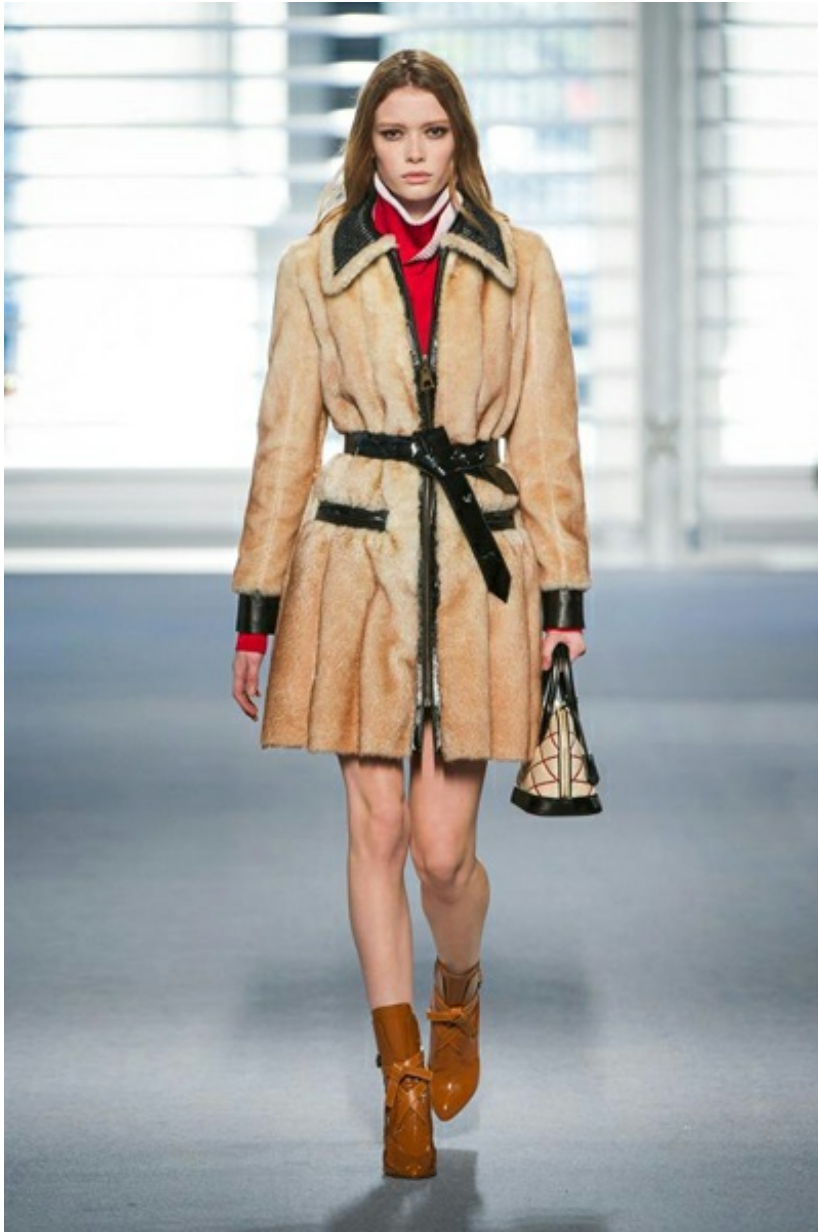
Louis Vuitton fall/winter 2014 runway show

Compared to the spectacle Louis Vuitton runway shows became known for under the creative direction of Marc Jacobs, the label's fall/winter 2014 fashion show, the first by Mr. Ghesquière, showed a focus on simplicity.