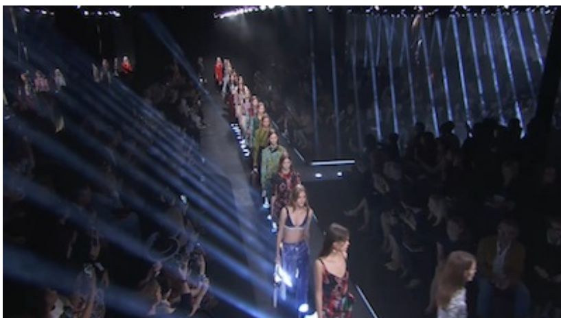
Louis Vuitton runway show at Fondation Louis Vuitton

The museum, opened to the public Oct. 27, was both the backdrop and the focus of the beginning of the show, in which large holograms of a mix of men and women spoke with a single monotonous voice about the "place that doesn't exist for now," "a ship that serves as an incubator and ignites our fellow creative minds." This served to further connect the eponymous label with the art project conceived by LVMH ( see story ).