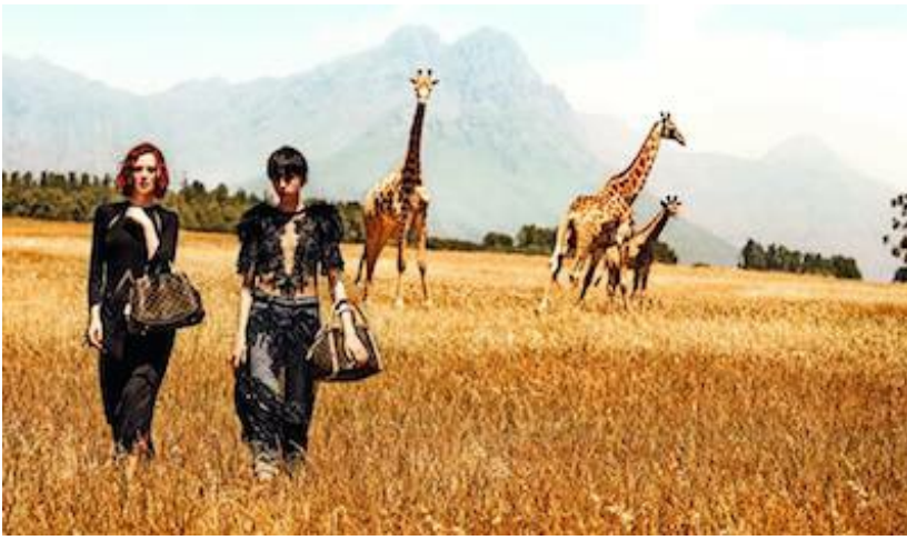
Louis Vuitton Spirit of Travel campaign image

Louis Vuitton reinterpreted the house's codes and visual imagery under the direction of Nicolas Ghesquière for his first advertisement campaign as creative director, titled "Series 1."