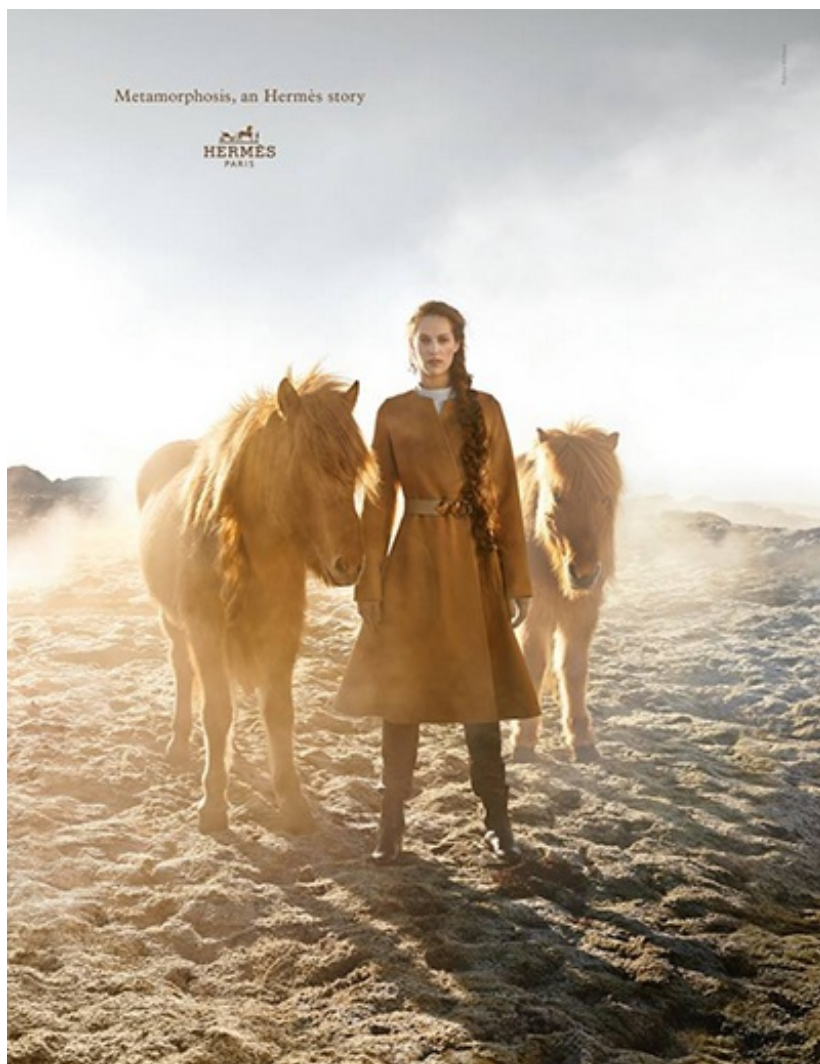
Hermès campaign image

In addition to social videos, in 2014, Hermès' print campaigns stood out from the pack with two different Metamorphosis campaigns. For spring/summer, the ads featured models in its ready-to-wear and accessory pieces set within a thick jungle of palm fronds and large leaves ( see story ). Fall/winter saw an equestrian theme, with models and horses with matching manes standing in a foggy, craggy hinterland, and the horses have a magical quality to them due to digital retouching ( see story ).