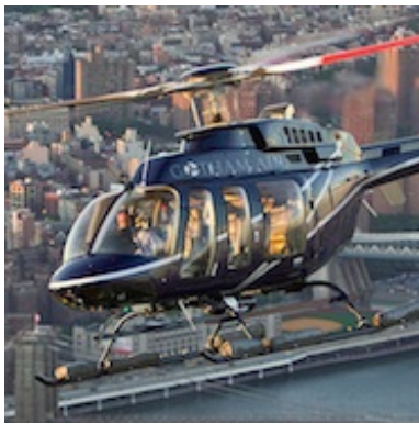
Gotham Air helicopter