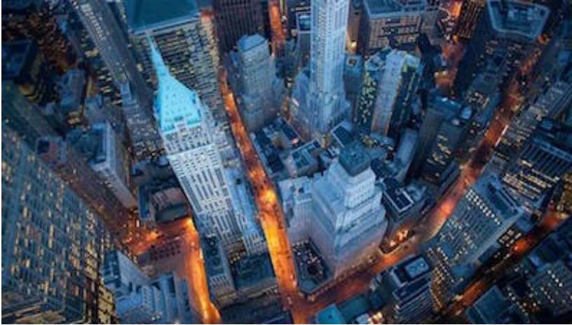
View on way to Newark Airport

When a consumer opens the app the next upcoming flight appears on the home screen with the amount of seats available and price per seat listed. Users have the option to search other dates and request a new flight.