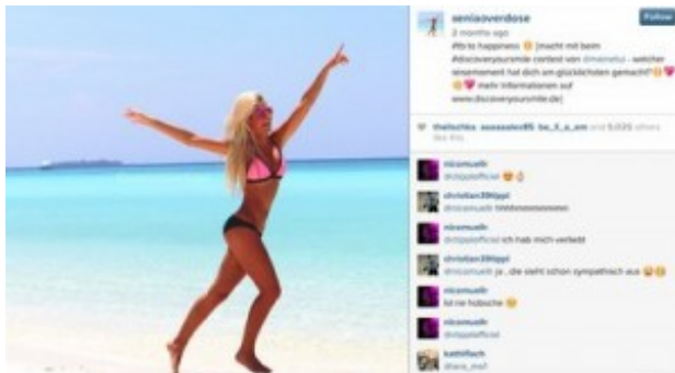
TUI social campaign on Instagram

To promote participation, influencers encouraged their followers to post their own holiday picture that made them happy.