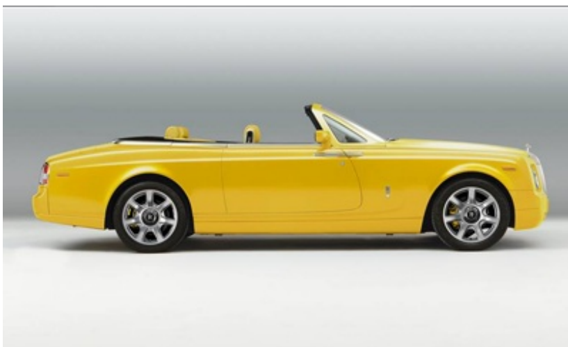
Rolls Royce Phantom

The film also features easels made of glass and concrete, which are frequently found in Ms. Bardi's designs. Finally, the presentation of the film will be done in such a way to evoke Ms. Bardi's work.