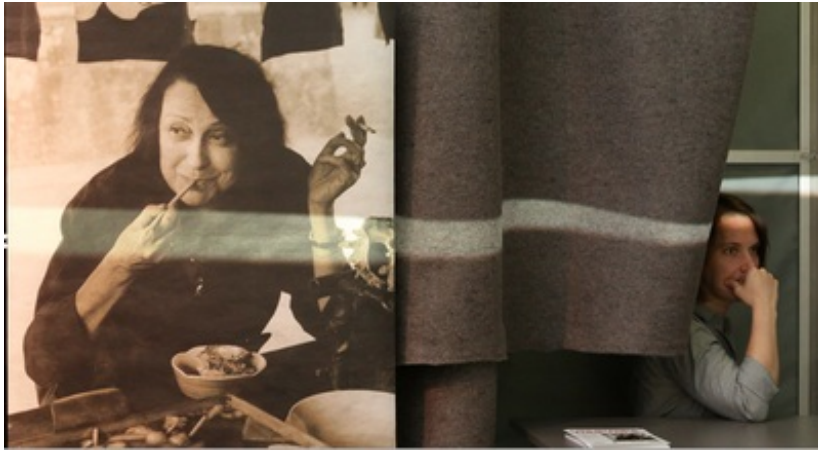
Ms. Bardi in documentary "Lina Bo Bardi: Together"

wrote about her preference for the elemental beauty of natural elements over precious stones. He wanted to explore the dichotomies, both objective and subjective, between stones and diamonds.