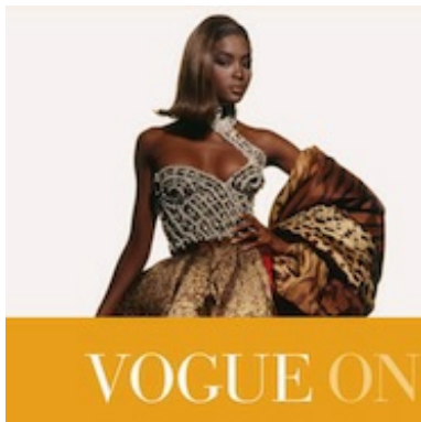
Vogue On: Gianni Versace cover