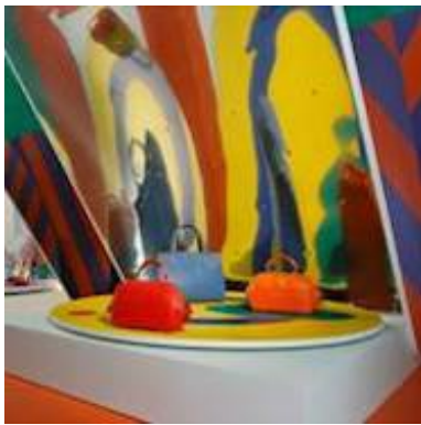
Barneys' SpinCycle window display