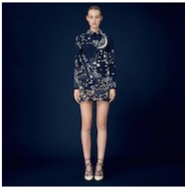
Valentino fall/winter 2015 look