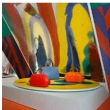
Barneys' SpinCycle window display