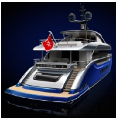
Dynamiq customizable superyacht