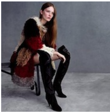
Marni capsule for Net-A-Porter