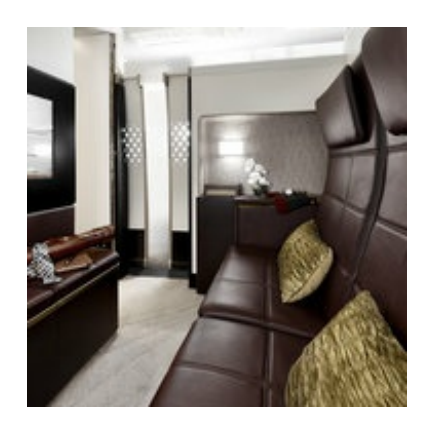
Etihad's The Residence lounge area