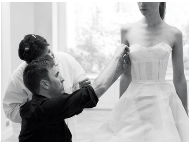
Raf Simons at work on his first collection for Dior

The split, according to WWD , was amicable, with the two parties separating after they had trouble seeing eye-to-eye on a new contract.