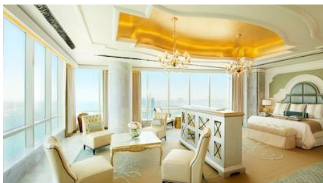
Al Manhal Suite at St. Regis Abu Dhabi

At twilight, guests will retire to their 3,200-square-foot Al Manhal Suite, complete with views of the city and the sea. During their stay, a butler will be on hand to anticipate and cater to their needs.