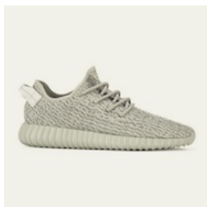
Yeezy Season 1 Boost 350 adidas sneakers, available at Barneys