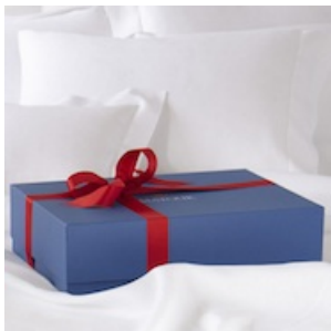
Airing clean linen

Why you should attend: Hear a cross-section of the nation's leading experts discuss strategy, tactics, execution, results and analysis for gaining or maintaining market share in a rapidly evolving luxury market where the consumer is leading the change as much as brands. Also network with fellow attendees who are senior executives and decision-makers at leading marketers in this 11-hour serious transfer of knowledge