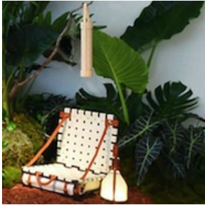
Louis Vuitton's Objets Nomades exhibit