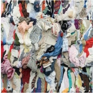
Stella McCartney sustainable fabrics