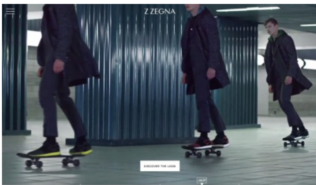
Z Zegna fall/winter 2015 video still

Armani may see being an "eco-brand" as contradictory or insignificant to a brand's DNA, as its social media postings tend to focus on celebrity and fashion shows, which more directly suggest luxury. Still, falling short on sustainable efforts could cause even more damage to the brand.