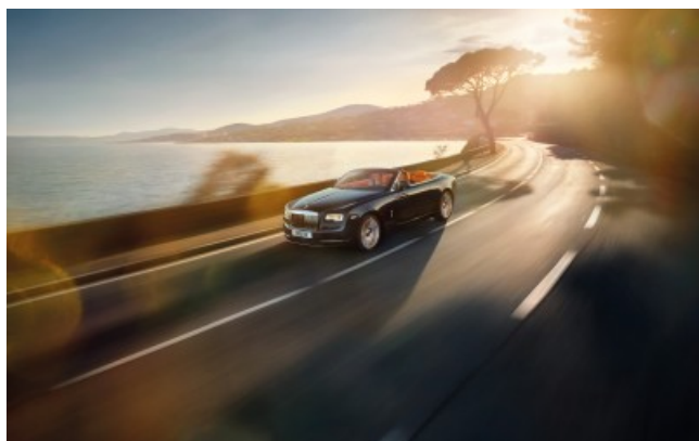
Promotional image for the Rolls-Royce Dawn