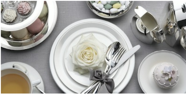
Promotional image for Harrods' Gift Bureau

Beyond homewares, art and kitchen goods, the Gift Bureau also offers bespoke and comprehensive services, including beauty, spa and bridal gown services, for brides and men's made-to-measure.