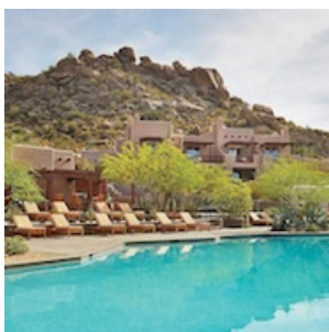
Pool at Four Seasons Resort Scottsdale at Troon North, AZ