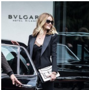
Rosie Huntington-Whiteley at Milan Fashion Week, wearing Bulgari accessories