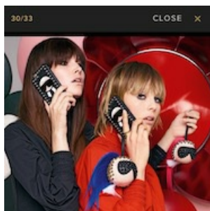
Karl Lagerfeld-shot advertising campaign for Fendi