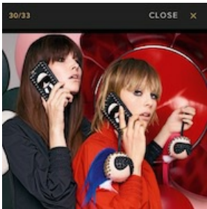
Karl Lagerfeld-shot advertising campaign for Fendi