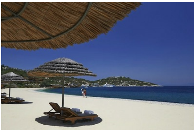
Beach at Mandarin Oriental, Bodrum

entertainment experience combined with the bespoke luxury offering of our resort will create new and vibrant experiences for all of our guests this summer."