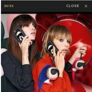
Karl Lagerfeld-shot advertising campaign for Fendi