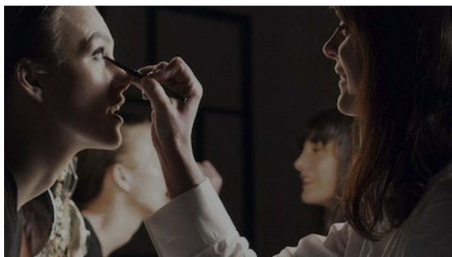
Video still from Chanel Beauty Talks Episode 2

As the video continues, Ms. Knightley talks to Ms. Pica about beauty tips such as combing eyebrows frequently and how to apply eyeshadow. The pair also discuss using their fingers to create a more "lived in" look.