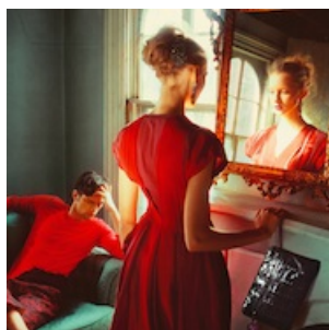
Nan Goldin for Bottega Veneta's Art of Collaboration