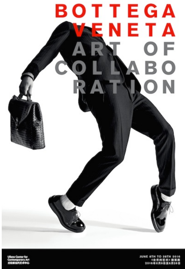
Art of Collaboration poster

tendency towards a short life span, often forgotten after a season, so this book extends the impact this editorial imagery can have (see story).