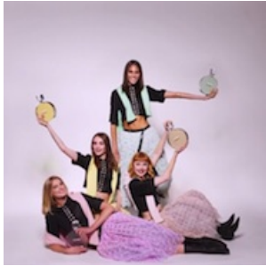
Chanel Chance at Studio Chance