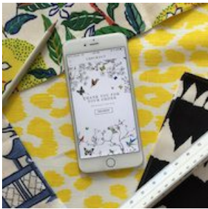
Screenshot of Schumacher's mobile app