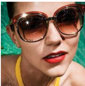
Marie Claire #GetFramed promotional image

Working with advertising and marketing platform Opera Mediaworks and Immersion, the developer of TouchSense technology, Lexus saw sizable increases in click-through rates, completed views, replay rates and ad recall for touch-enabled ads. As mobile use increases and brands fight to engage viewers saturated with advertising, haptic ads offer a way to stand out ( see story ).