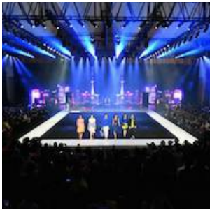
Tmall Luxury Flash-Sale Channel fashion show

The Skyjet app offers the consumer the opportunity to determine which type of aircraft is best suited to the occasion with immediate pricing and availability. As with the automotive industry, the jet industry is moving away from traditional models and shifting to an on-demand standard that better suits the needs of today's consumer ( see story ).