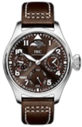
IWC Pilot's Watch