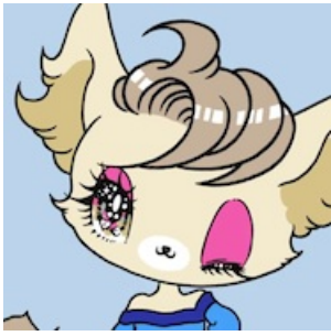
Michael Kors' Michelle the Cat