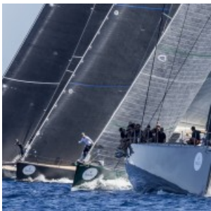
Maxi Yacht Rolex Cup 2015

The new Tmall Luxury Flash-Sale Channel made its official debut with a star-studded runway show on March 30, during which millions of consumers tuned in to watch and purchase the 42 looks immediately available on Tmall's mobile phone application. Selling pieces from more than 300 labels including Armani, Ermenegildo Zegna and Stuart Weitzman, the new shopping platform creates a place for Chinese consumers to purchase international luxury brands with confidence ( see story ).