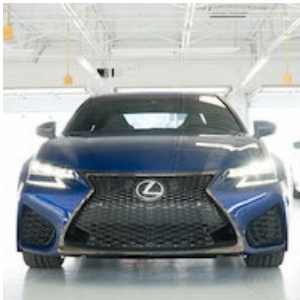
Lexus GS F

The Skywriter campaign allows users to write a message in the sky and share it with third parties. An interactive and social campaign will help attract a younger consumer segment to the brand while subtly offering an introduction to the brand's latest watches ( see story ).