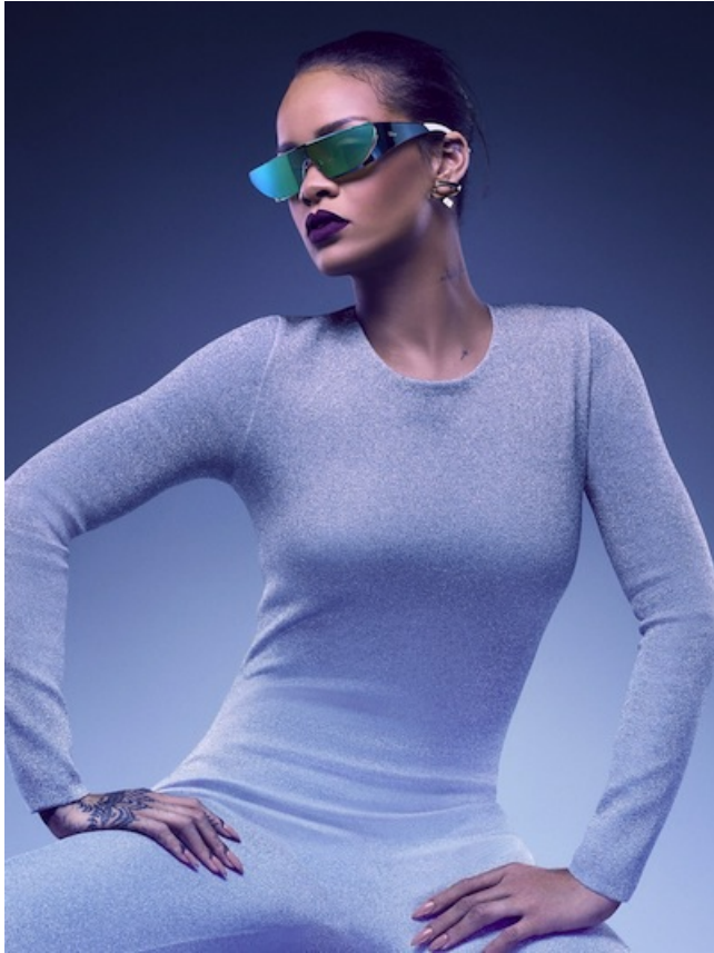
Rihanna for Dior sunglasses

In 2015, Rihanna fronted Dior's Secret Garden IV campaign, helping to modernize its brand image and tap into the singer's high-profile celebrity. In May 2016, it was announced that Rihanna had worked with Dior to design a pair of sunglasses ( see story ).