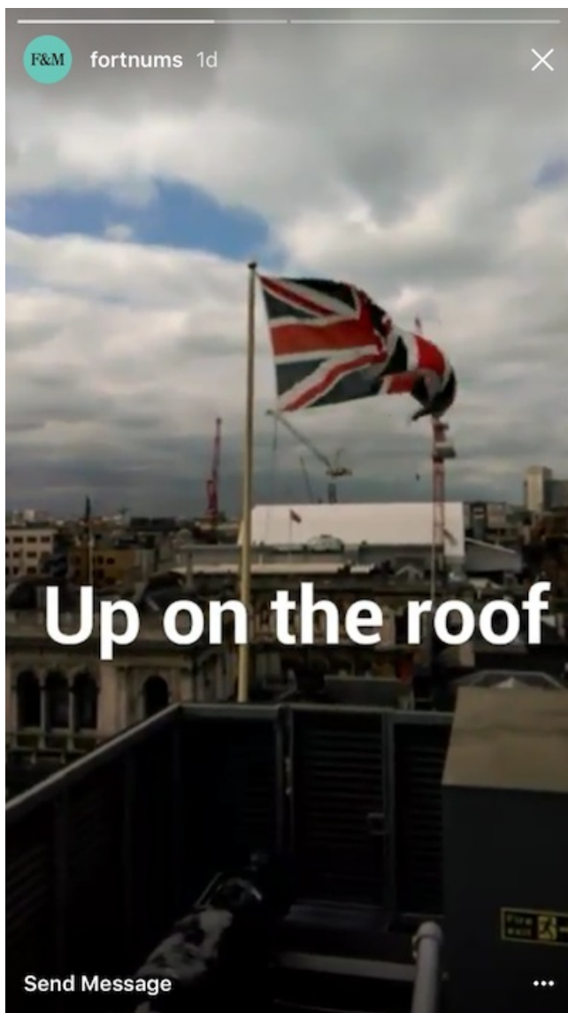
Fortnums & Mason's Instagram story

Instagram adoption rates recently neared 100 percent, but Snapchat penetration lags behind, as brands remain unsure if the platform is right for them, according to a report from L2 ( see more ).