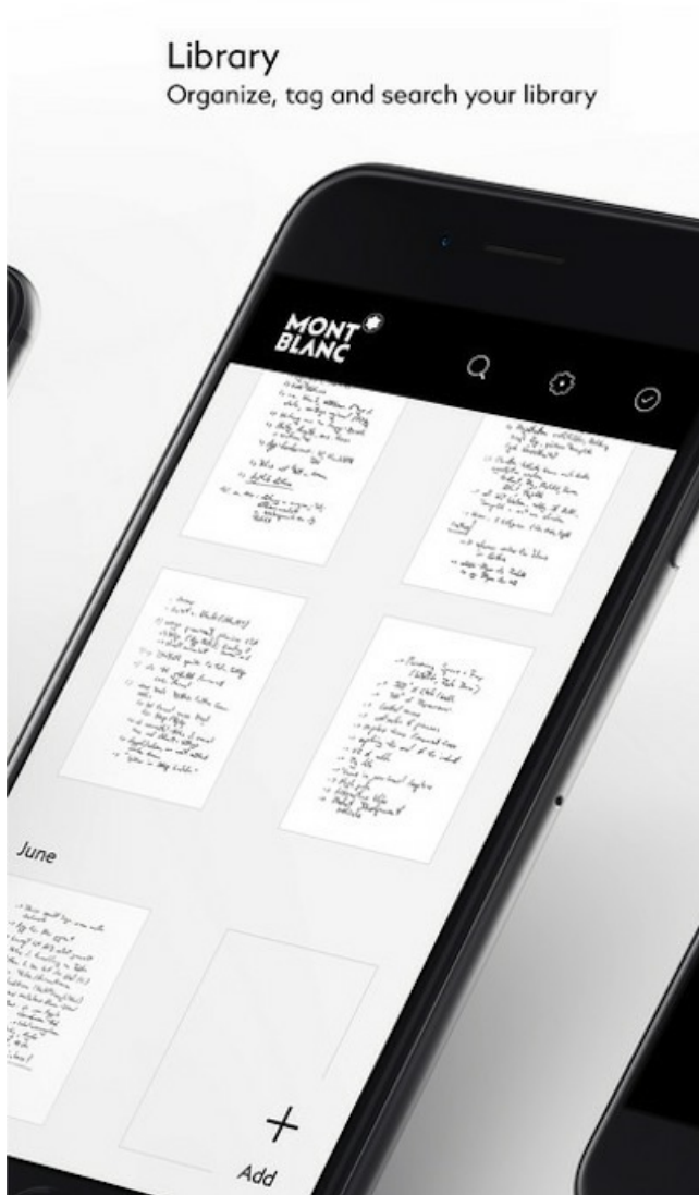
Montblanc Hub mobile app

Writers can jot down letters, notes, sketches and more, which will be imported into the mobile app through a WiFi connection. Within the app, users can edit their work and share with others through email and text.