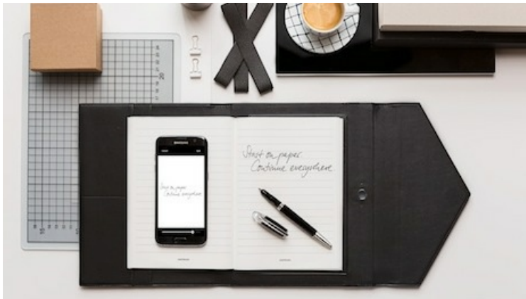
Montblanc's new augmented paper