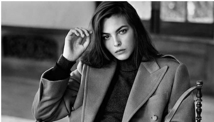
Ralph Lauren's Iconic Style campaign