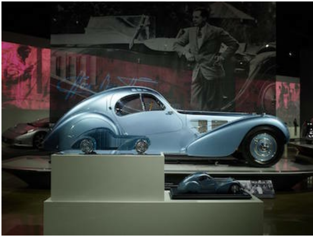
The Art of Bugatti display at the Petersen Automotive Museum

Automakers often stage museum exhibitions that flaunt craftsmanship, innovation and history.