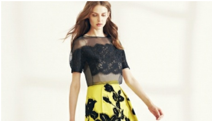
Carolina Herrera, resort 2016