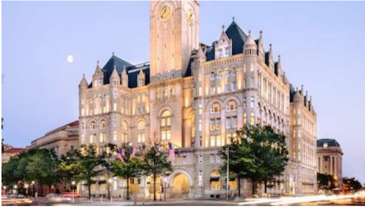
Trump International Hotel, Washington, D.C.