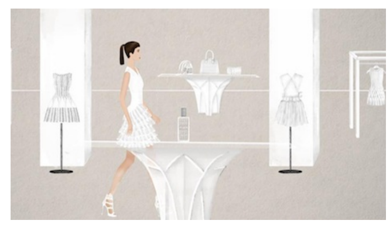
Animated still for Alaa Eau de Parfum Blanche