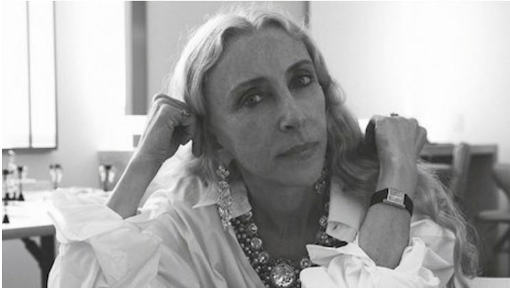
Vogue Italia's Franca Sozzani, 1950-2016