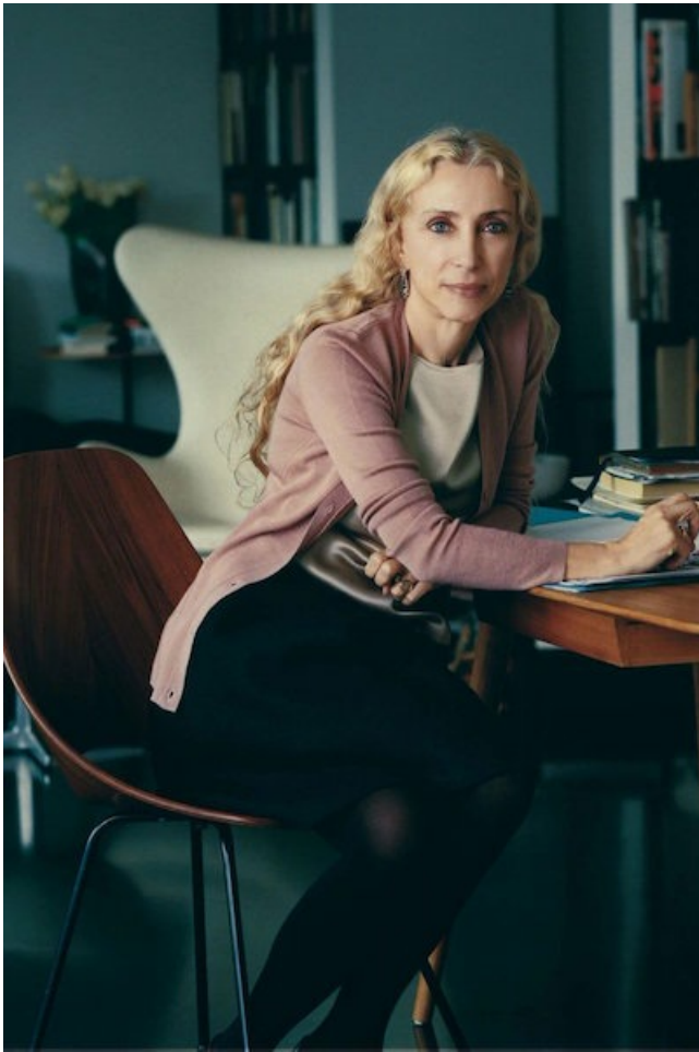
Franca Sozzani, 1950-2016

That same month, Anna Wintour was made editor in chief of American Vogue. The two have been dear friends for 30 years, a relationship that Ms. Wintour said in a blog post published to Vogue.com , she is "happy and honored to say sustained itself" for three decades.