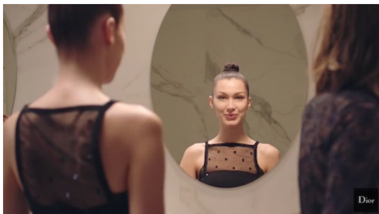
Bella Hadid for Dior Makeup