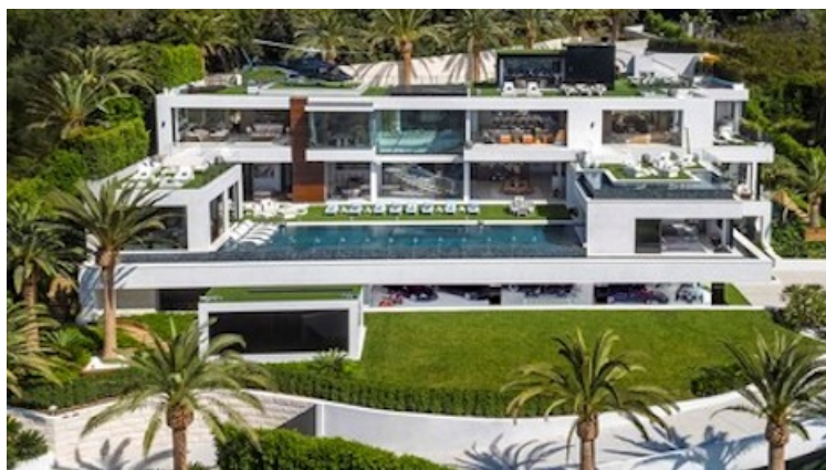
924 Bel Air Road designed by Bruce Makowsky