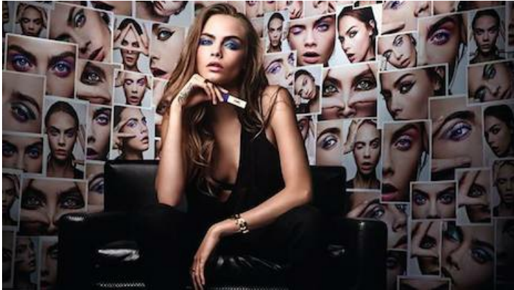
Cara Delevingne for YSL Beauty's Mascara Vinyl Couture