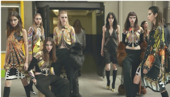
Givenchy fall 2016